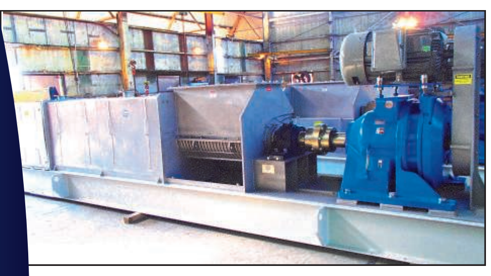
This VP-24 was built for Corn Wet Milling and is equipped with the optional inlet hopper screen.