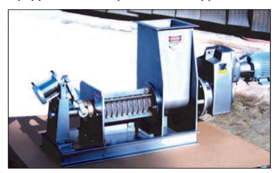
The CP-4 lab screw press is our most popular model. Results with it can be scaled to larger presses.